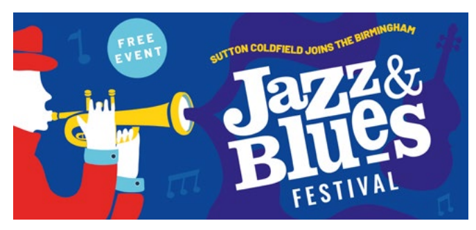
Birmingham Jazz Festival 18-27 July