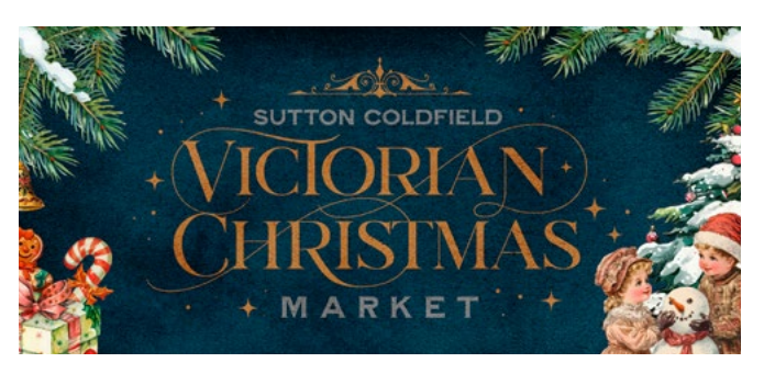
Victorian Christmas Market 11–14 & 18–21 December