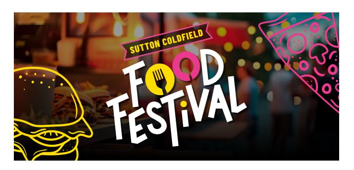
Sutton Coldfield Food Festival 12–14 September